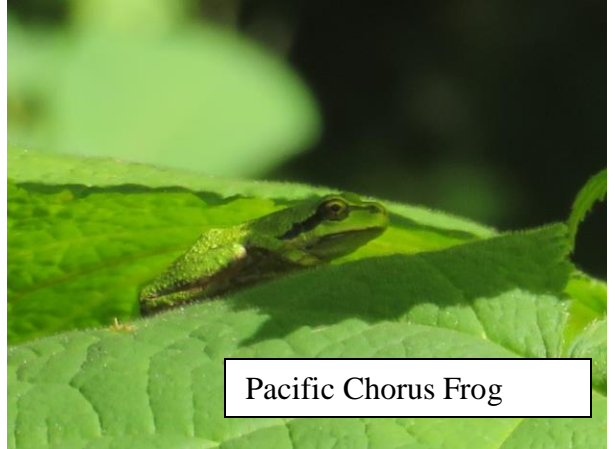
Pacific Chorus Frog

donated the land for Hillkeep, hosted us for coffee. From the deck we had a fine view of the Valley.