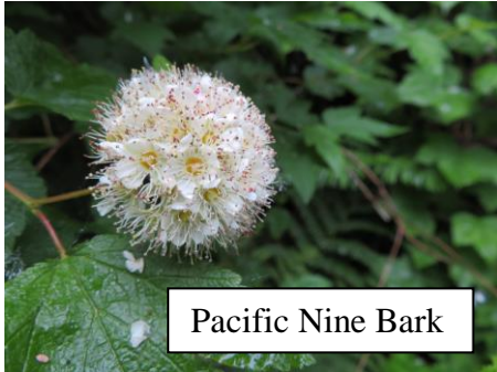
Pacific Nine Bark