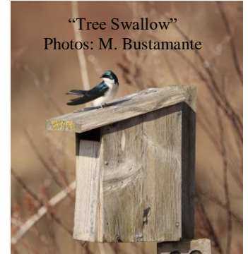
“Tree Swallow”