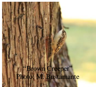
“Brown Creeper”