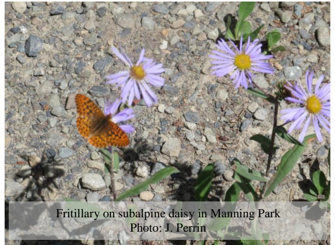
Fritillary on subalpine daisy in Manning Park