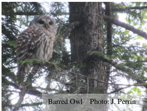
Barred Owl