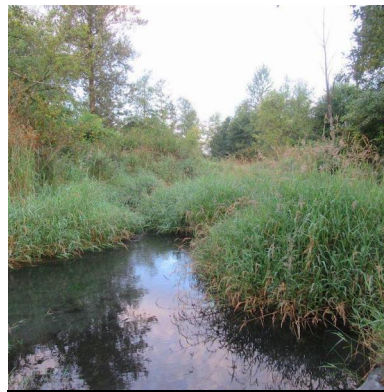
Figure II. Peach Creek Wetlands...