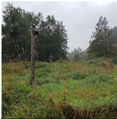
Figure 1. Popkum tall grass wet-meadow habitat ....